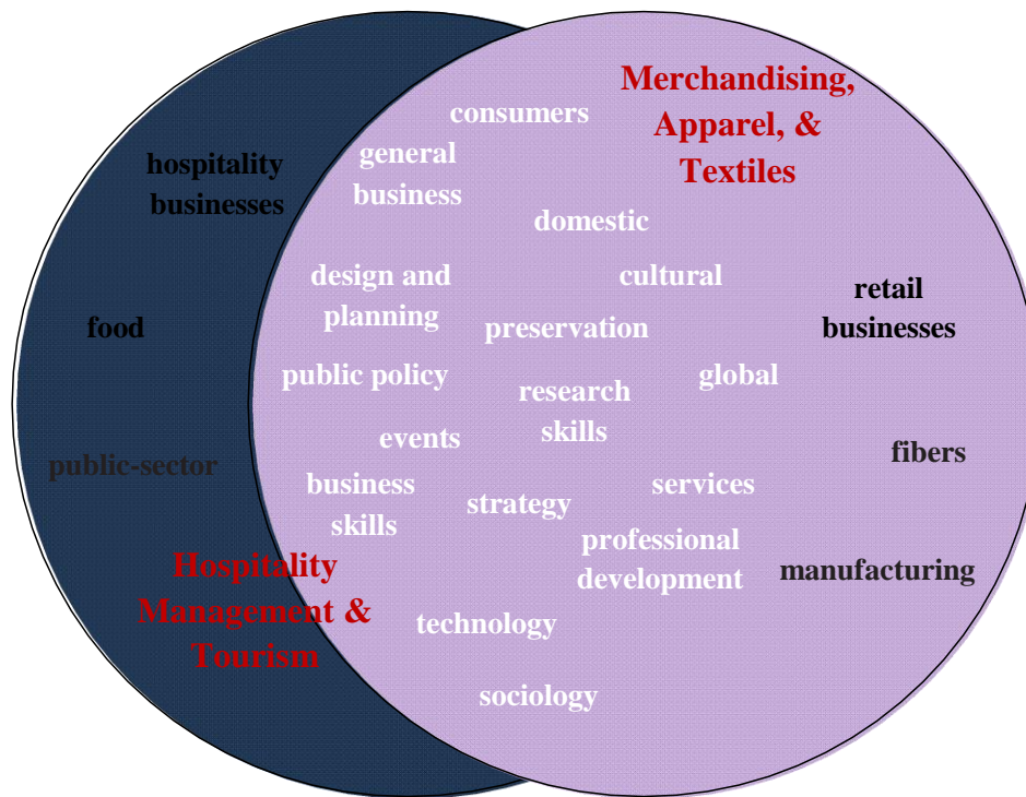
Figure 1. A depiction of the synergies between both programs

The vision of the new Department of Retailing and Tourism Management would be: